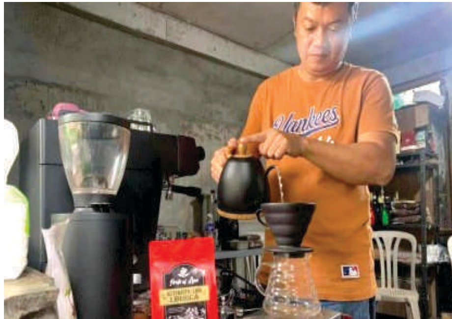
CAFFEINE FIX. Brewing Batangas' "kapeng barako" or the liberica coffee variety. The Office of the Provincial Agriculturist in Batangas is currently processing its registration with the Intellectual Property Office of the Philippines to secure its collective mark and strengthen the branding of local coffee products.

He thanked the provincial government, Batangas State University (BSU) and De La Salle-Lipa (DLSL), IPOP HL, and Department of Trade and Industry (DTI), among others, for providing technical support to finalize the collective mark registration. (PNA/PC)