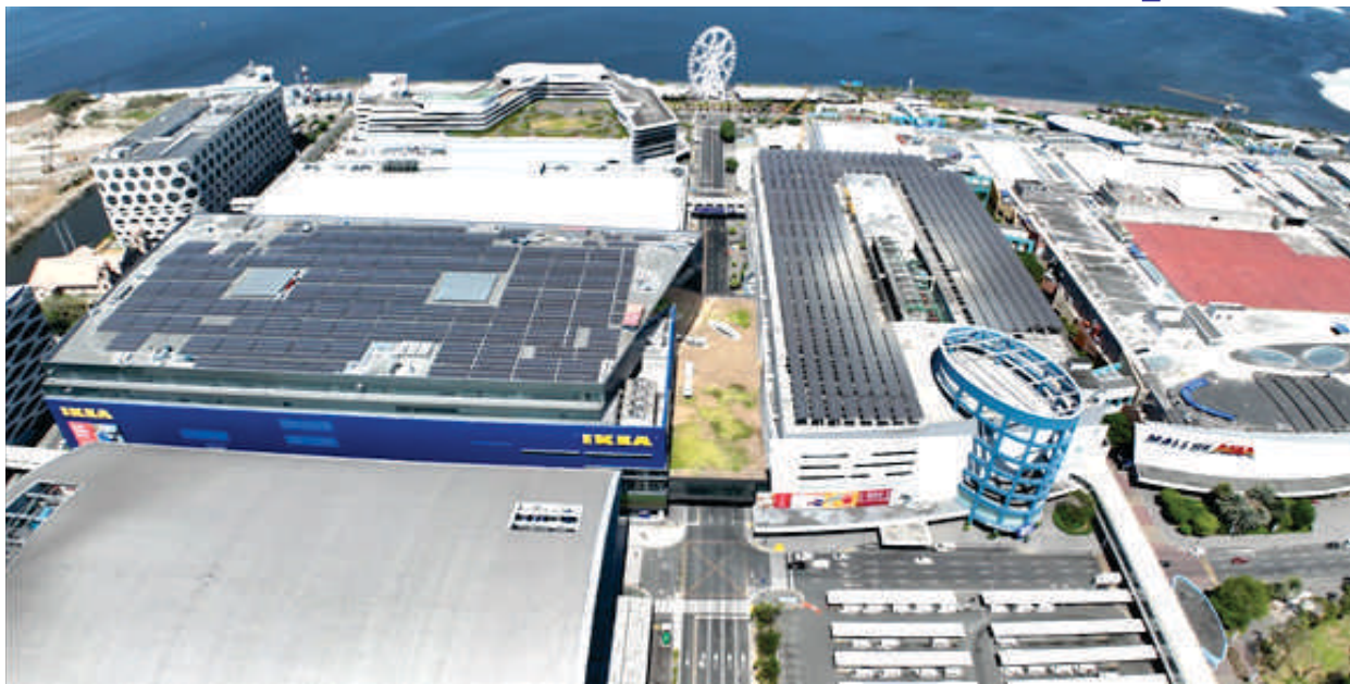
More than 3,600 solar panels were installed on the roof of MOA Square in the Mall of Asia Complex.