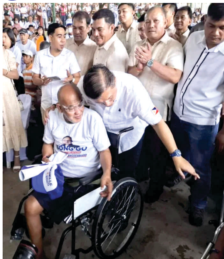
HELPING HAND Sen. Bong Go gives a brand new wheelchair to a person with disability in Amadeo, Cavite, on Aug. 5, 2024.

The senator thanked the people for the warm welcome and promised more projects for the town that will benefit its citizenry, youth and other sectors of the society. (The Manila Times/RA)