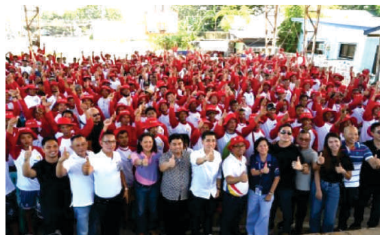
AID FOR FISHERS. Oil spill-affected fisherfolk in Tanza, Cavite receive their Tulong Panghanapbuhay sa Ating Disadvantaged/Displaced Workers (TUPAD) salaries at Capipisa Covered Court in Barangay West Capipisa on Wednesday (Aug. 7, 2024). The Department of Labor and Employment (DOLE) in the province disbursed over PHP6.12 million for a total of 1,178 individuals.

THE Department of Labor and Employment (DOLE) in Cavite on Wednesday disbursed over PHP6.12 million to support 1,178 individuals in the municipality of Tanza, who have been impacted by the temporary fishing ban due to the oil spill in Bataan.